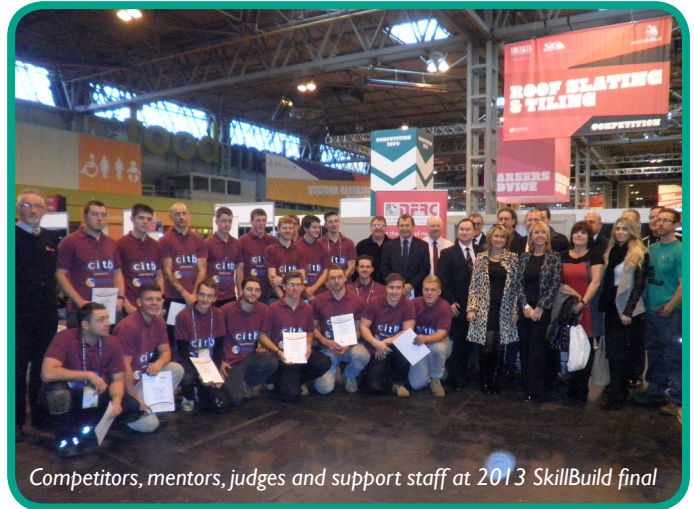
Competitors, mentors, judges and support staff at 2013 SkillBuild final

The winners of each competition will receive their prizes at the Gala Presentation Dinner which will be held on the Saturday after the competition closes.