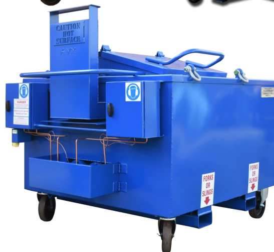
Top left: 3 Drum Hot Air Melter